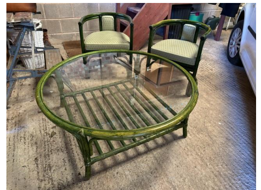
Table and 2 Chairs

Suitable for garden room or conservatory. FOC to good home - must be able to collect. Contact Christine Hill on 07711 556225 if you are interested. Christine