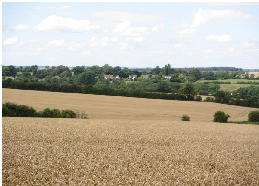
Harvest time in Keyham