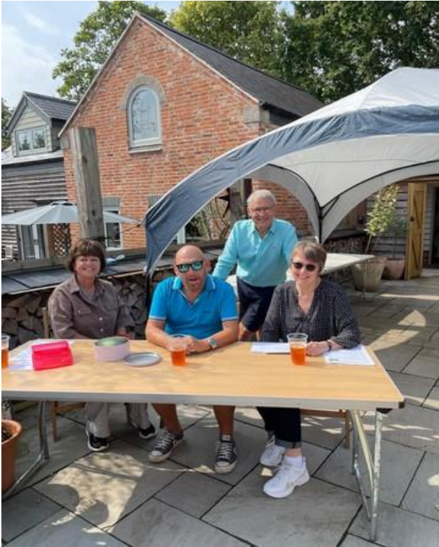
The Registration Team