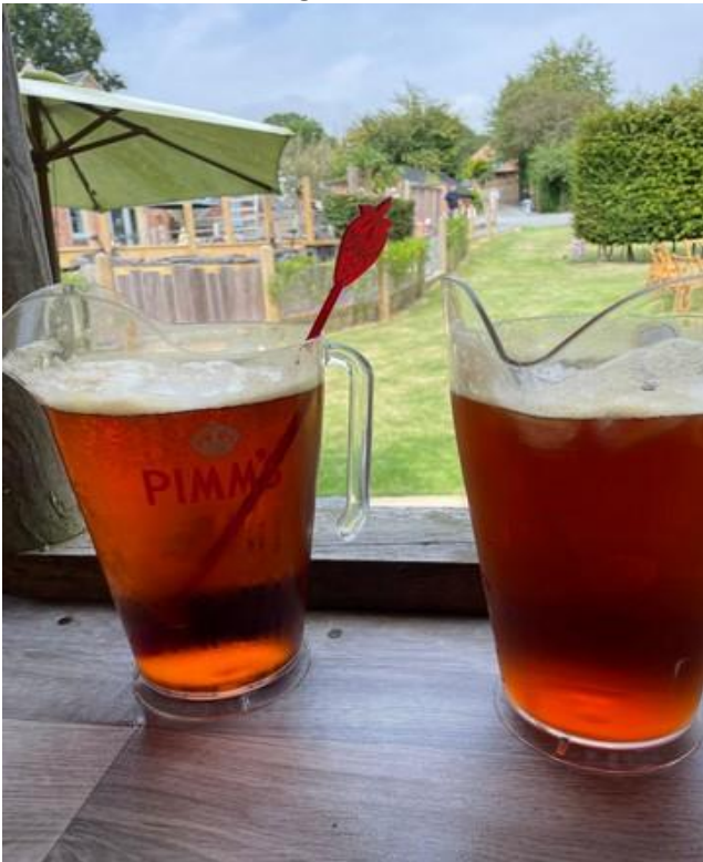
Time for a quick Pimms before play starts