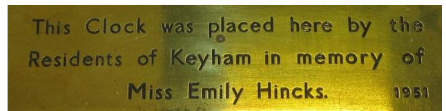
The story of the Hall Clock