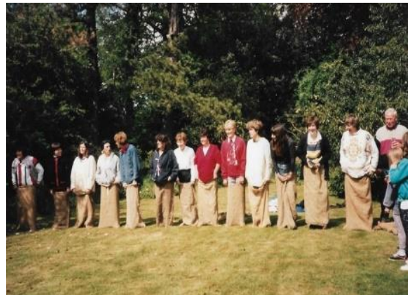
Keyham Sports Day at Nether Hall Ladies' Sack Race

As promise last month, here are some more photographs from the Tanglewood photo album.