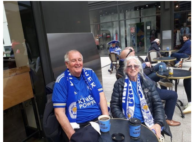
Pre-match tension builds

The 2nd half we were more in the game and then in the 63rd minute Yuri Tielemans scored the goal the whole stand went wild with excitement, 2 brilliant saves from our goalkeeper and a VAR decision that went in our favour and agonising minutes that seemed like hours and the referee blew the final whistle. The game was over we celebrated watched the presentation hugged strangers and shook hands and shed a tear for this was unbelievable - Leicester had won at the 4th time of asking.