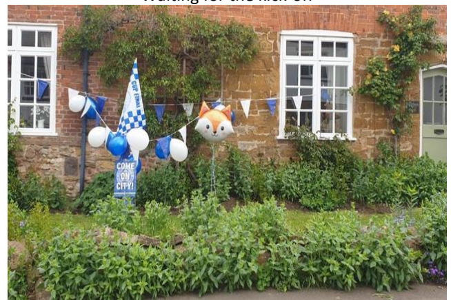
As usual, Blackthorn Farm was having a party; "LCFC Cup Final Ready" Lynette tells KN