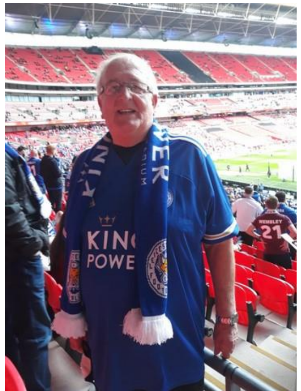
Waiting for the kick-off