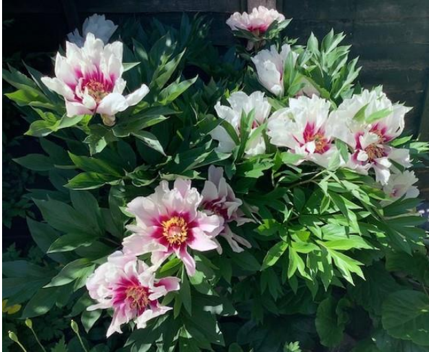
Old West End Farm – Tree Peony