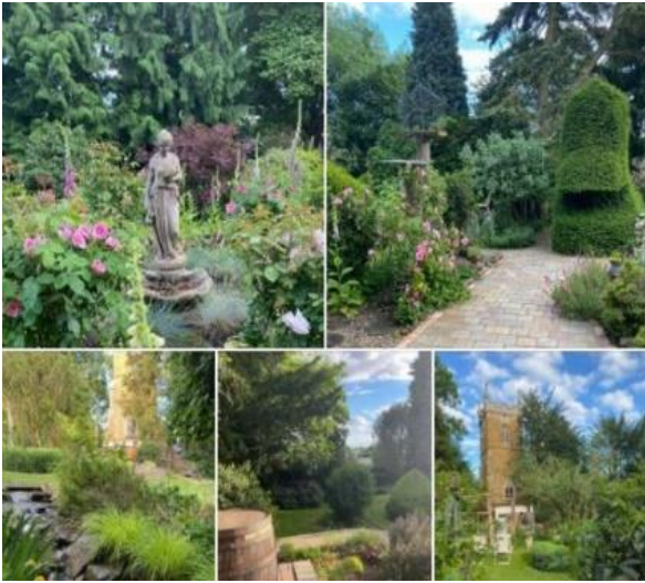
The Cottage - Collage from Keyham Village Facebook