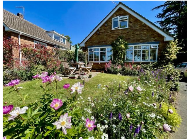
Ashlea – Front Garden