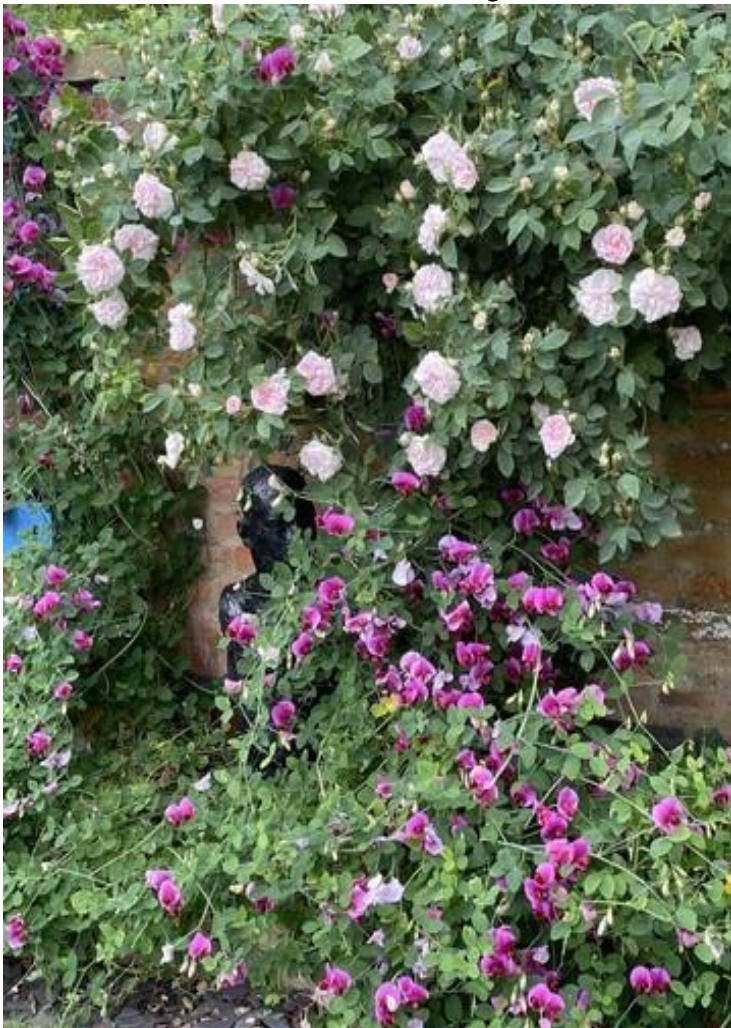
Vermont Cottage – Roses and Sweet Peas