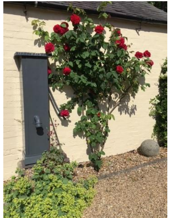
Fox End – Red Roses