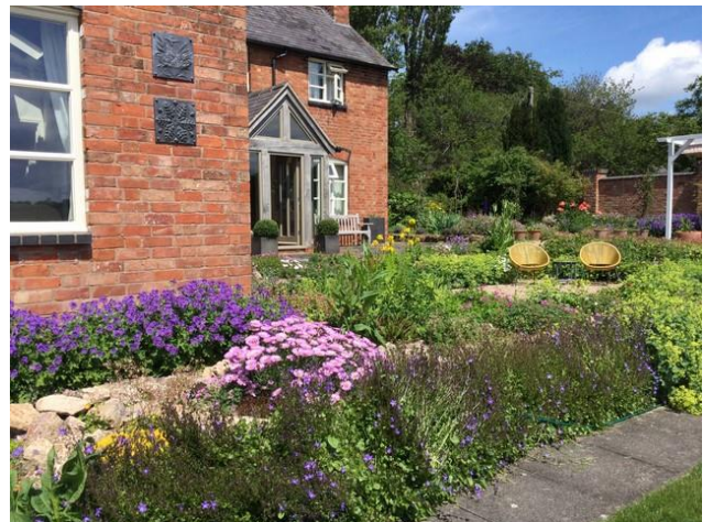
The Lodge – Rockery and Cottage Garden