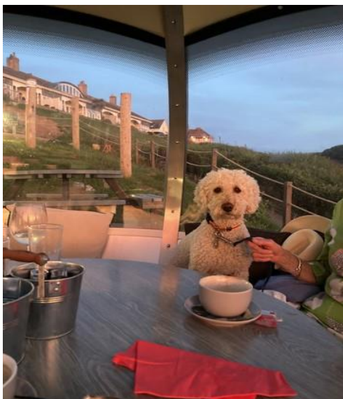
....and Poppy the dog

I am sitting looking out at our bird feeder and there are two spotted woodpeckers enjoying a feed as I type, lovely sight. They are swaying away making the whole thing rock around precariously!