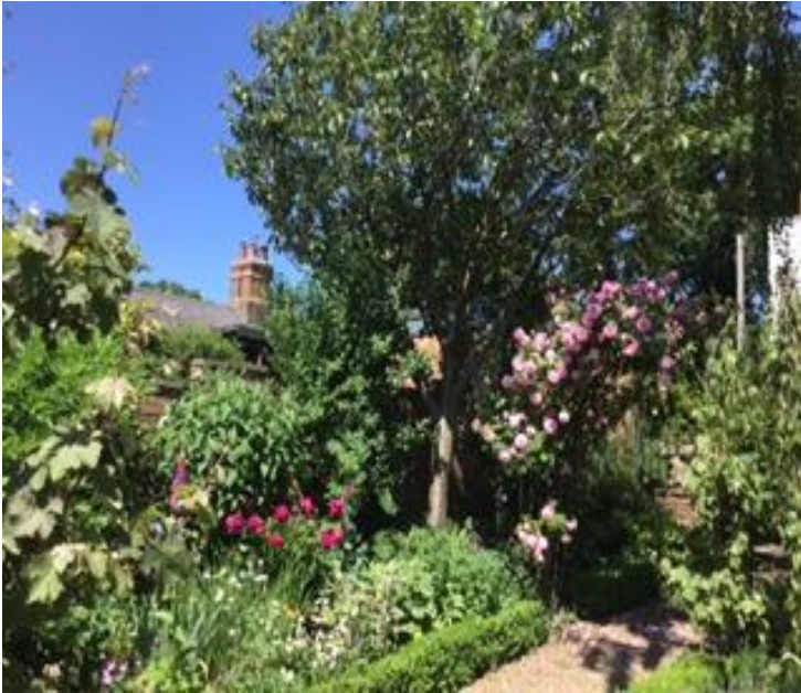
Old White House Farm - Cottage Garden