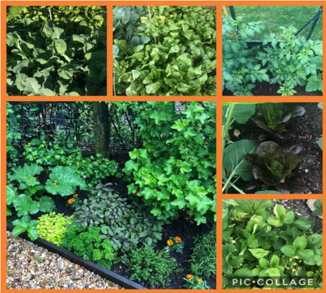
Marlow Cottage – Vegetable Collage