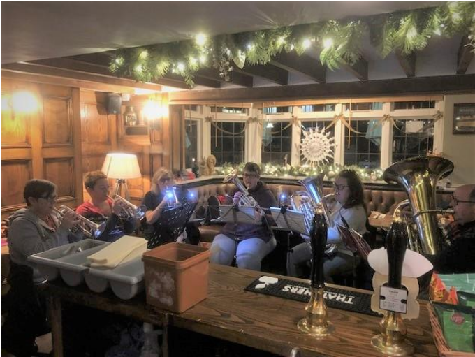
The band play Christmas Carols and Popular Tunes