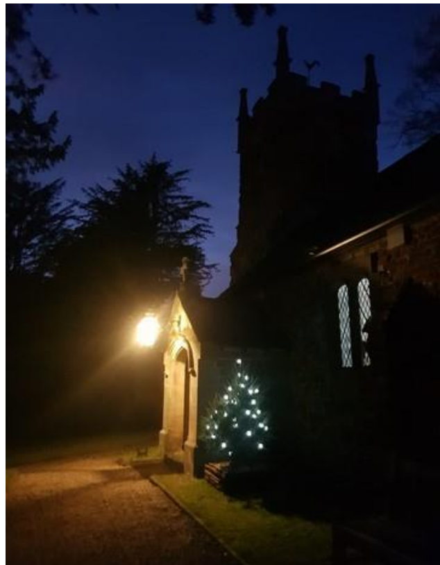
All Saints Church at Christmas