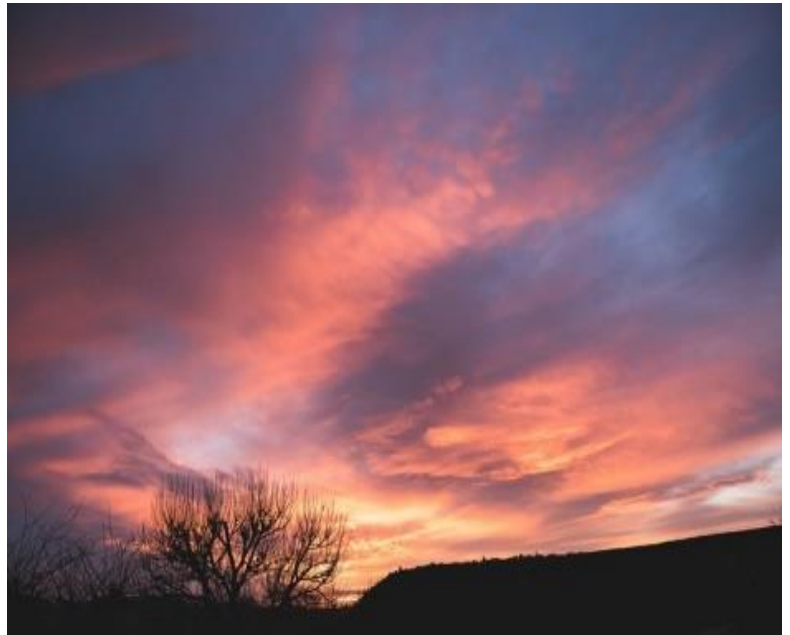
Sunset on Christmas Day Evening