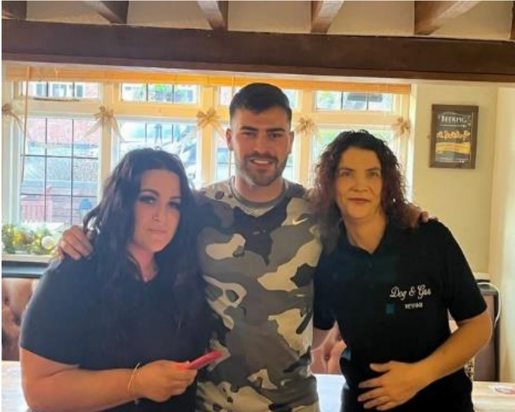
Owen Warner finished runner-up in I'm A Celebrity... Get Me Out of Here 2022 The young TV star is best known for his role in the Channel 4 soap opera Hollyoaks His family lives locally