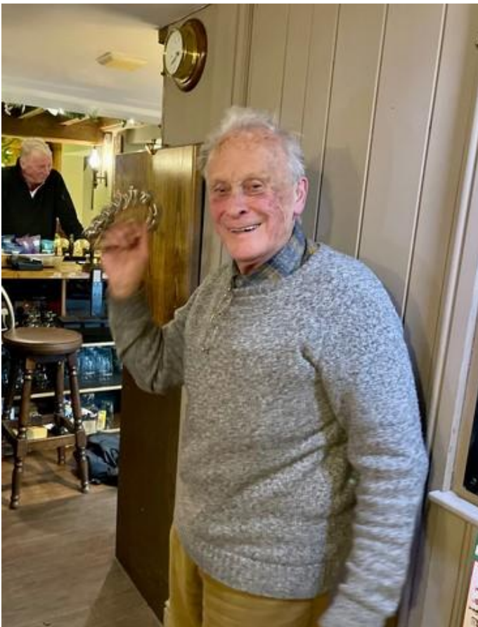
Woody joins in on the Bells (Sleigh, not Arthur Bell's Original)