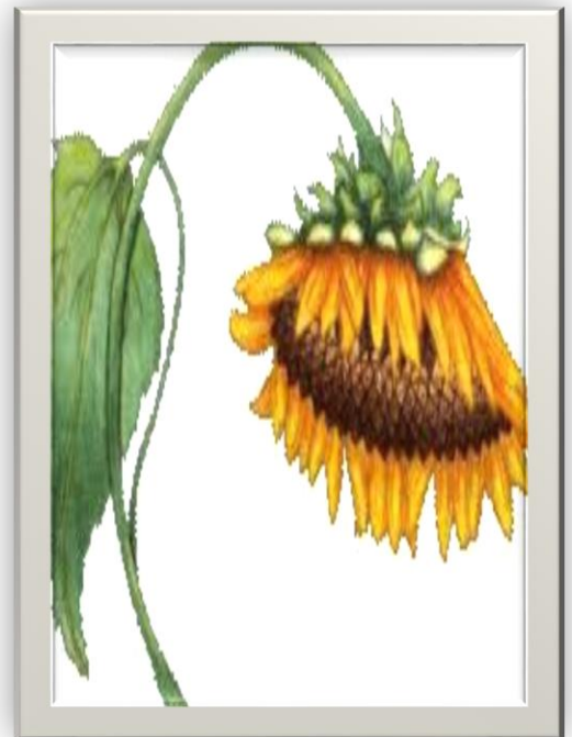
KOG: BOWS OUT?