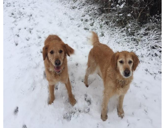
Alfie and Amber