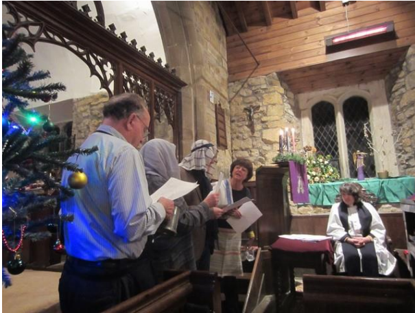
Keyham Carol Service