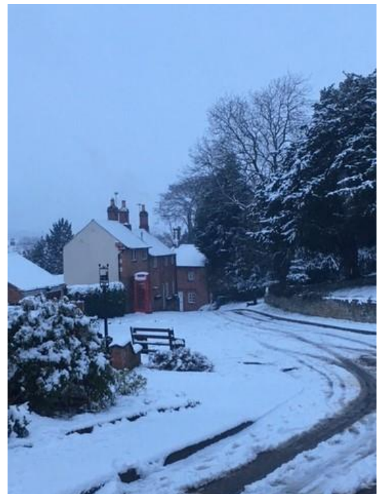
Main Street