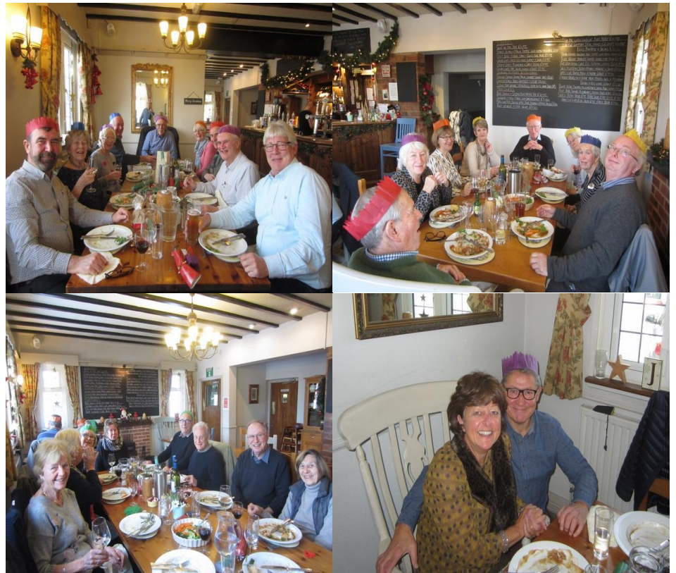
Pensioners' Lunch at the Black Boy