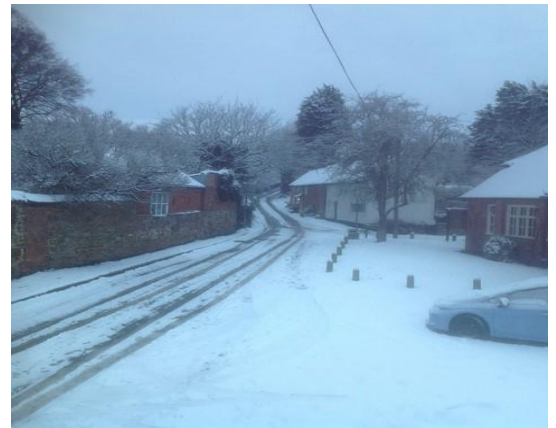
Well-named Snows Lane