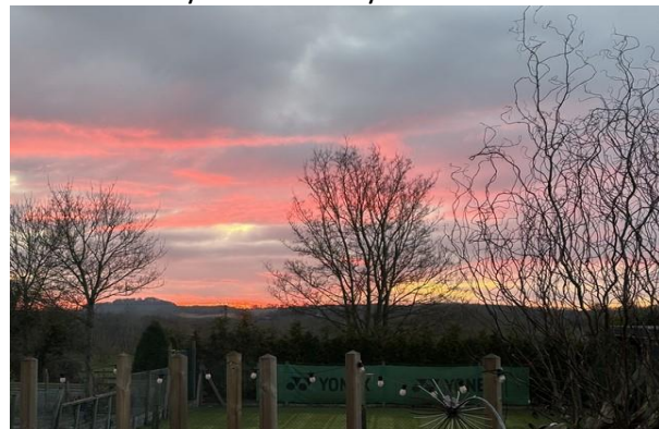
January Sunrise in Keyham