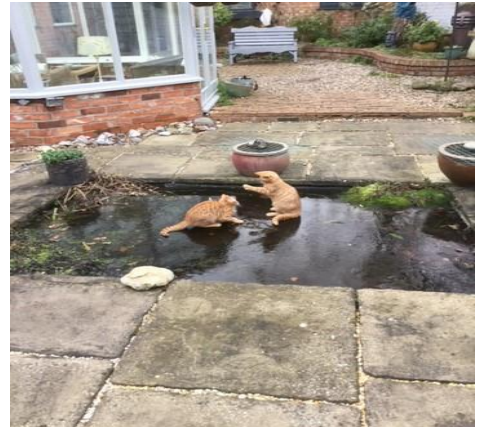
"Dancing on Ice"