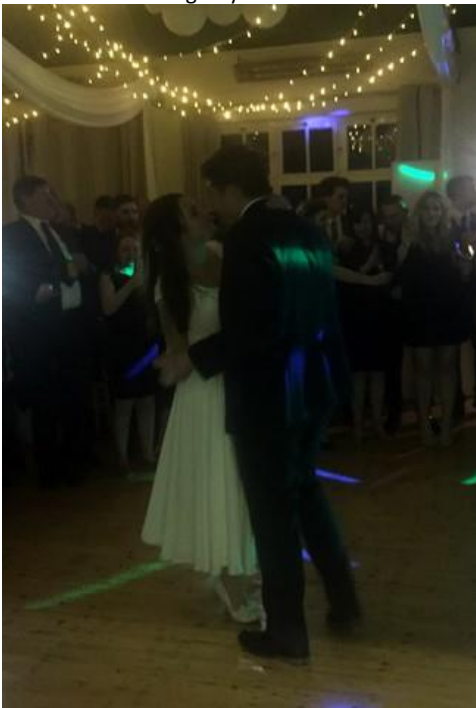
Wedding Day: First Dance