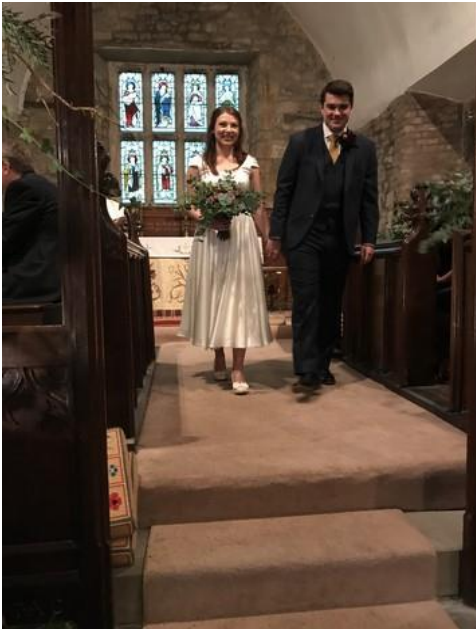
Wedding Day: Just Married