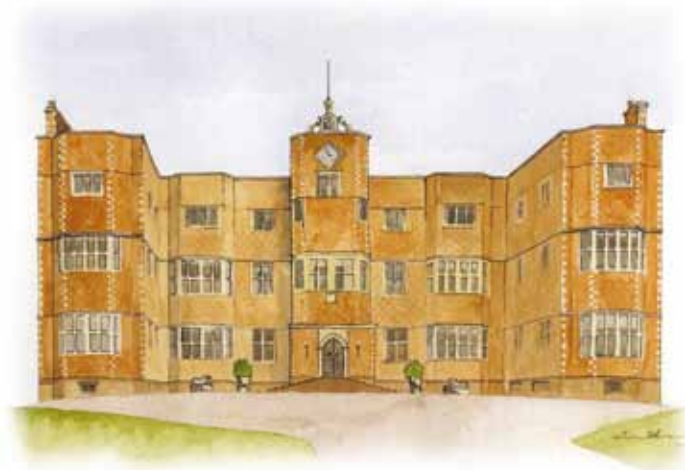
Illustrations by Avery Illustrations.

As you descend back to the village you can clearly see the ridge-and-furrow pattern left by medieval ploughing methods. The up and down ploughing of long narrow strips, with a certain type of plough, threw the soil towards the centre of the strip, so producing a high ridge. Much ridge-and-furrow disappeared with the intense ploughing during the Second World War, however a good deal remains in Leicestershire.